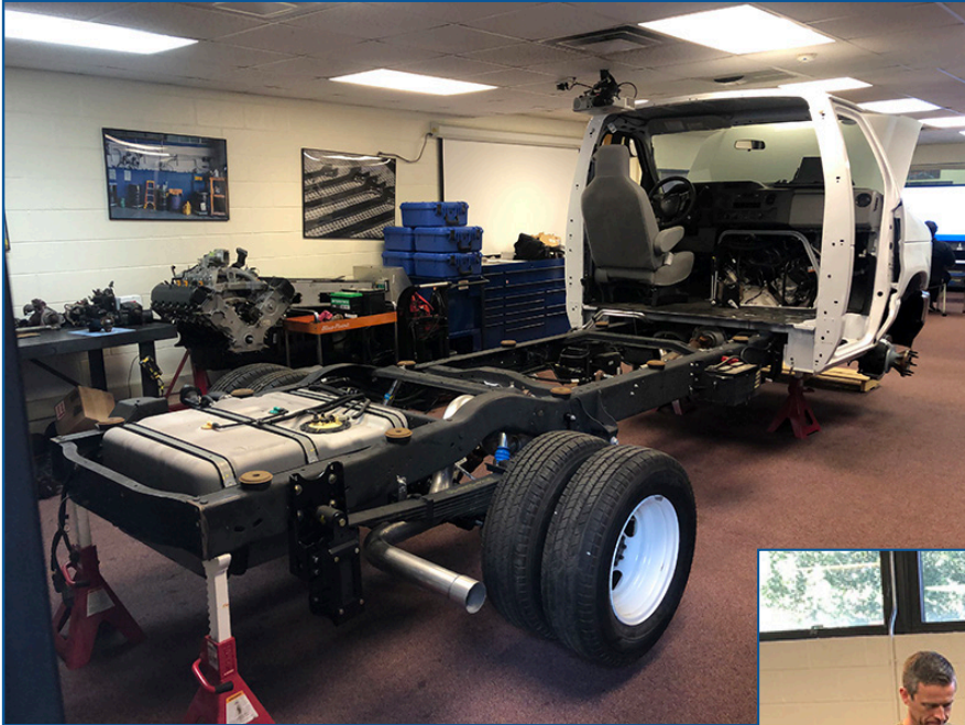
At Left and Above: LPIP recently purchased a training module from Turtle Top. Thanks are in order to Rob Cripes and the Turtle Top reps for their cooperation and quick response.