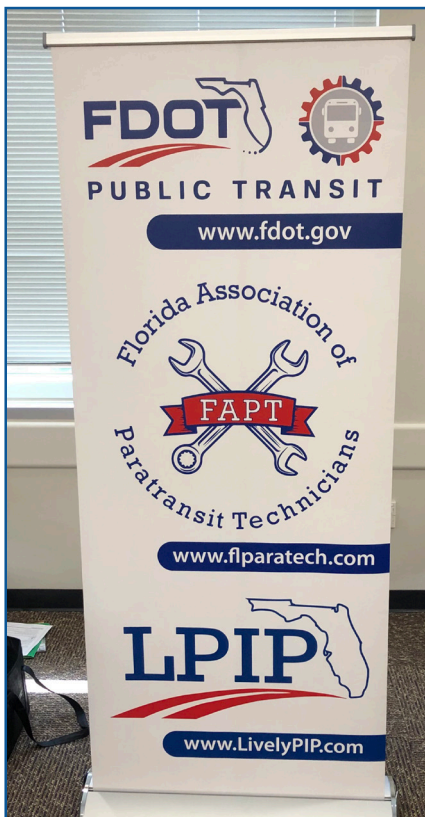
At Left: LPIP staff recently attended the District 5 Workshop and shared LPIP training related details with those in attendance. Thanks to Jarrell for the invitation and opportunity to be included.